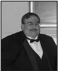
NSA State Director of the Year